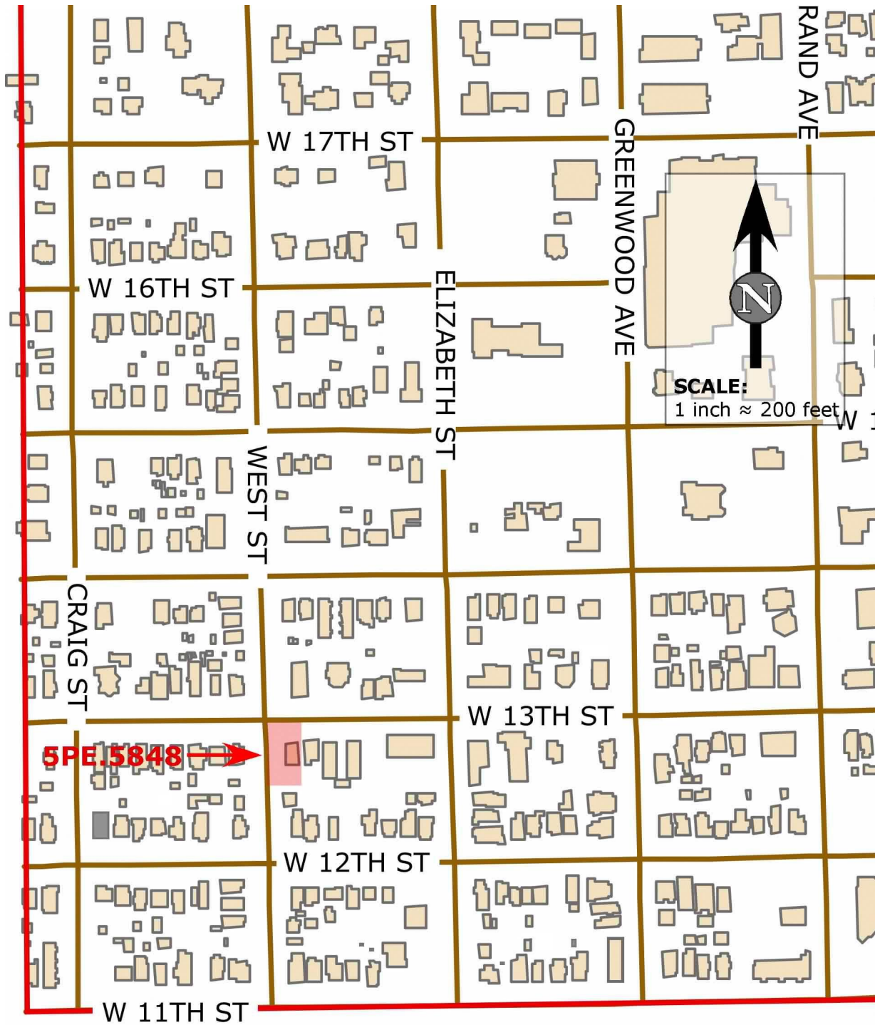
SITE SKETCH MAP