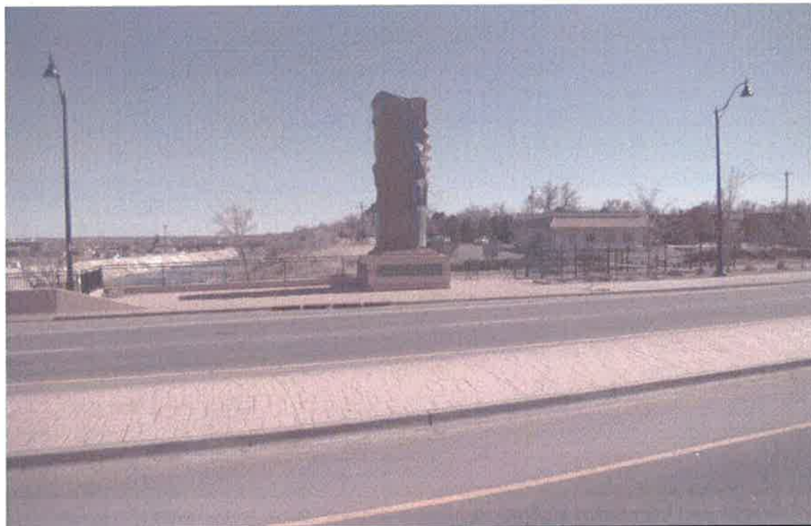
View southwest from eastbound State Highway 96 on the 4 th Street Bridge. Straight ahead is the Corona Park Historic District on the right side of the river.