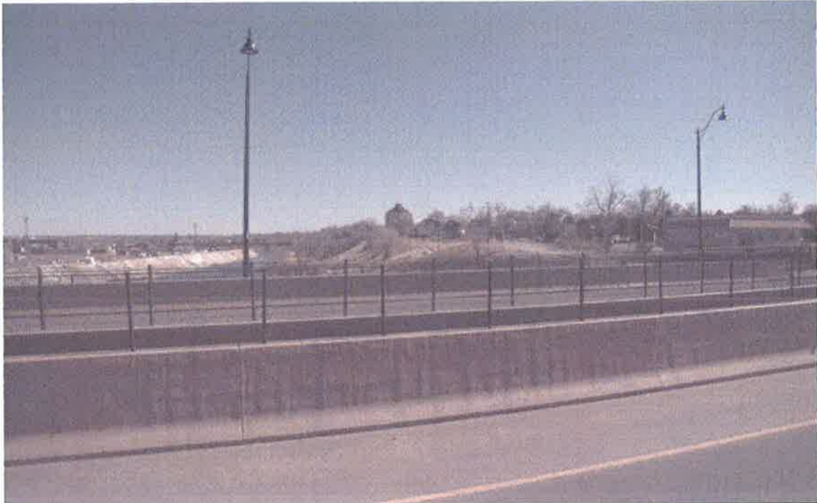
View southwest from eastbound State Highway 96 on the 4 th Street Bridge over the Arkansas River. To the right of the river is the Corona Park Historic District. Barely visible is the dirt access road down to the river, and part of the Arkansas River Trail.