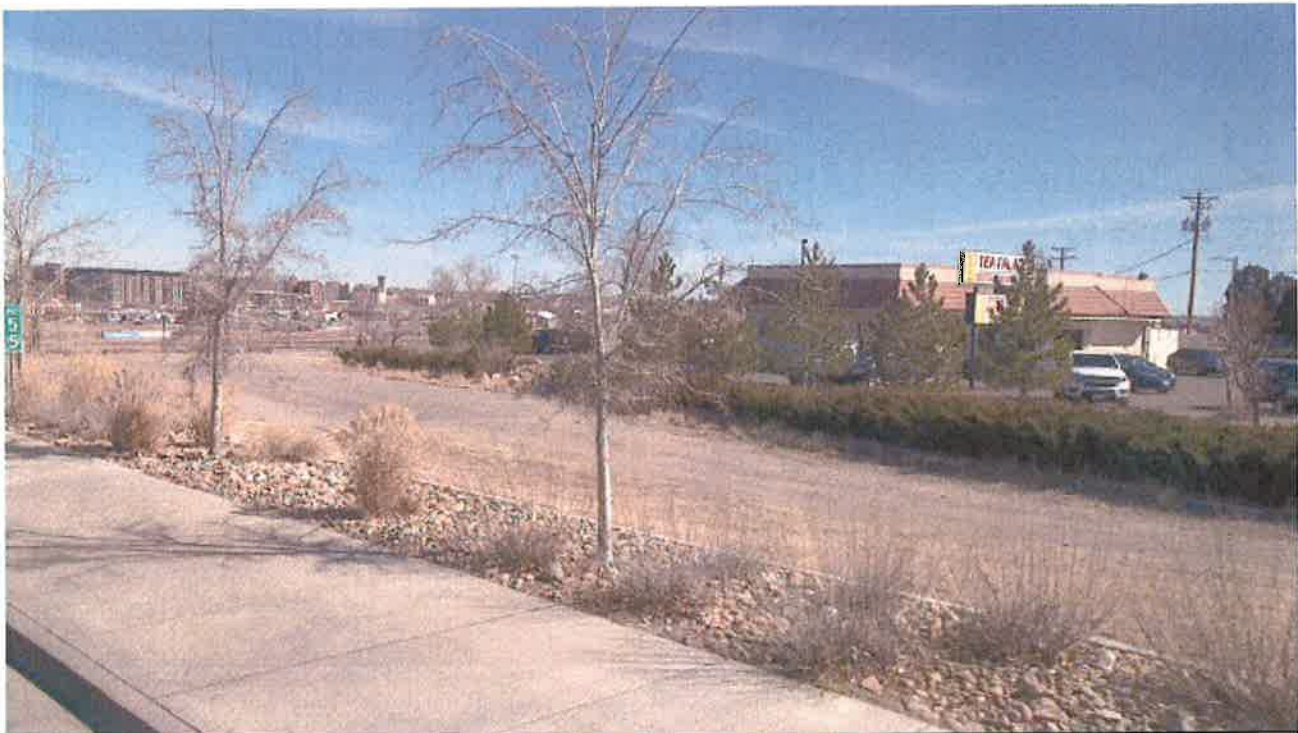
View west from westbound State Highway 96 within the Corona Park Historic District. The dirt access is an unofficial access point down to the Arkansas River.