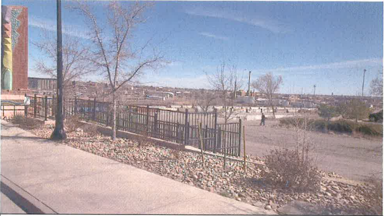
View west from westbound State Highway 96 within the Corona Park Historic District at the approach to the 4 th Street Bridge, looking out toward the Arkansas River and the Pueblo Rail Yard, as well as the dirt access down to the river.