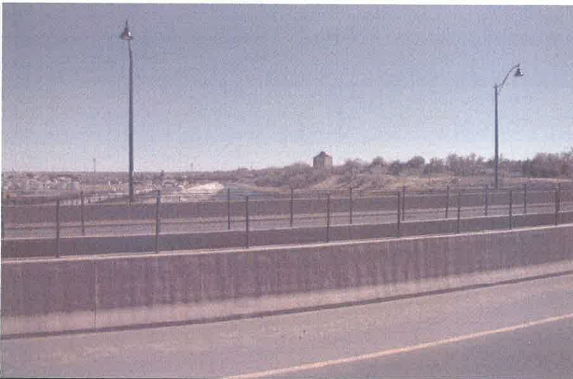
View southwest from eastbound State Highway 96 on the 4 th Street Bridge over the Arkansas River. To the right of the river are the bluffs and the Corona Park Historic District.