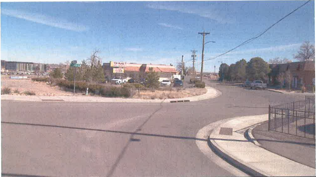
View west from westbound State Highway 96 (W. 4 th Street) at Chapa Place within the Corona Park Historic District. The dirt access by the road sign is an unofficial access point down to the Arkansas River and the Arkansas River Trail.